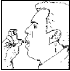
A. Open mouth. Hold Inhaler 1 to 2 inches away

Administer inhaler in 1 of these 3 ways: