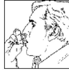
C. Hold inhaler in your Mouth